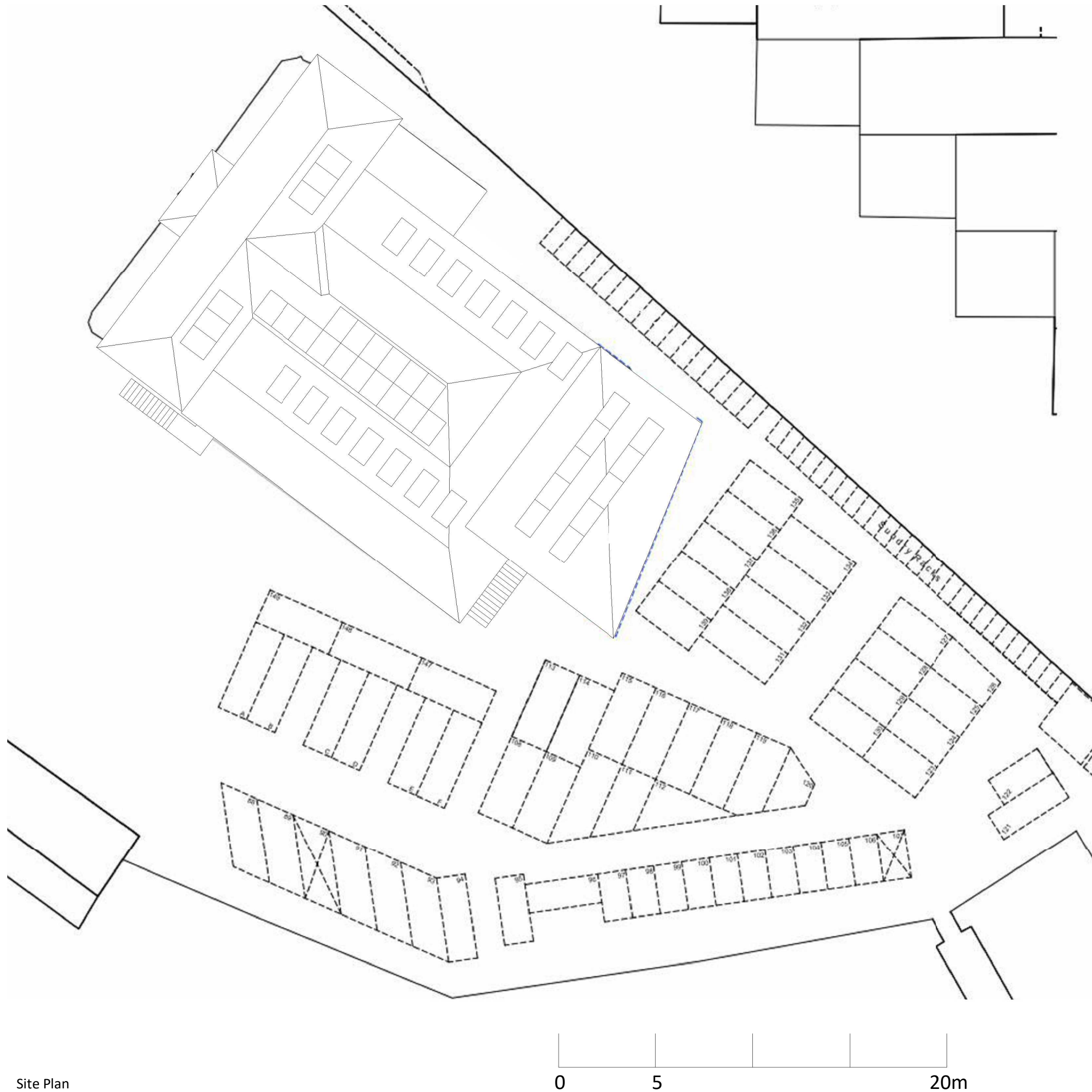
Site Plan 1 : 200